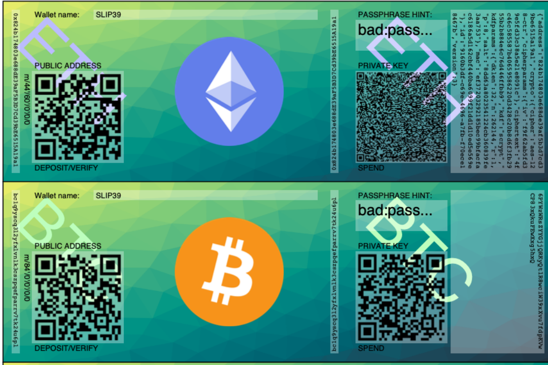
Figure 2: Paper Wallets (from --secret ffff... )