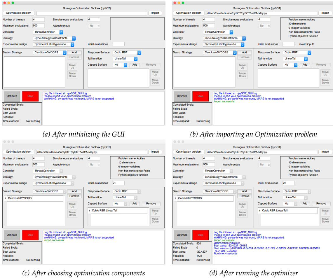
Figure 1: Illustration of the GUI

Note that both the file name and the class names are the same.