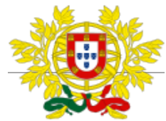
Coat of arms